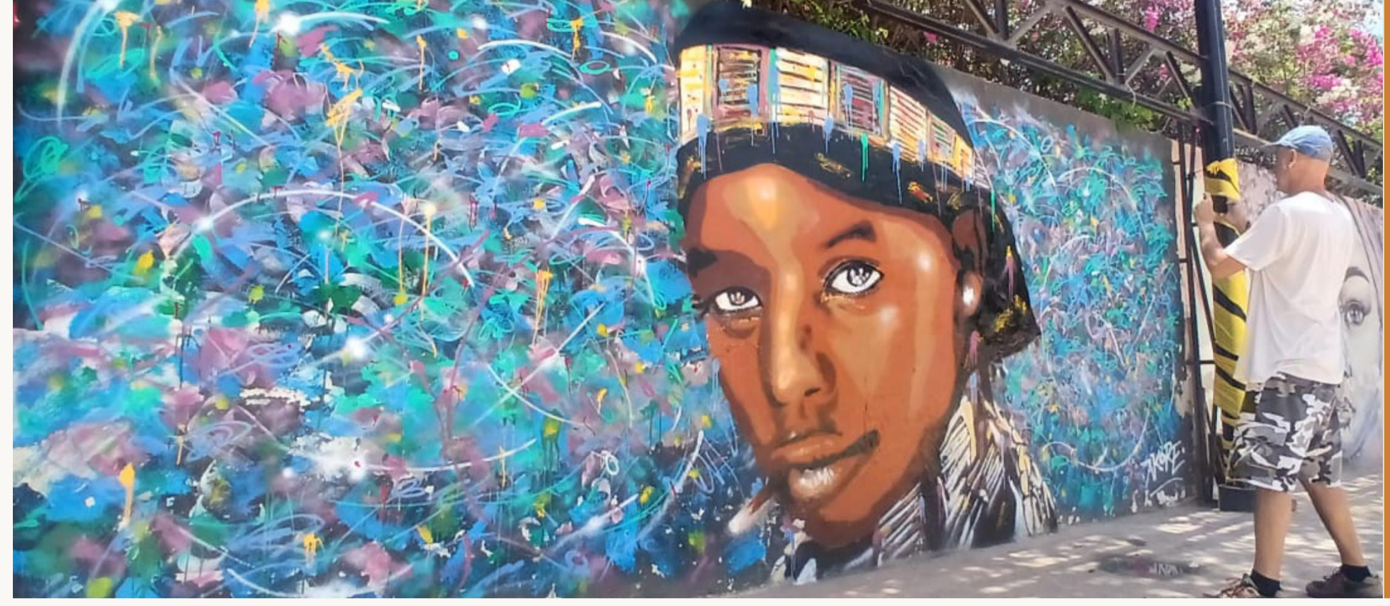
FEATURED MURAL: VISUAL MANIFESTATION OF THE "AFROCOLOR" CONCEPT.

It was during this period that he started working on his first sketches, illustrations, calligraphy, typography, tags, and graffiti. Over the years, he has developed a unique visual language that blends African aesthetics with graffiti, influencing other artists of his generation. He paints on illegal walls in broad daylight to break away from established norms. His visual style is rooted in post-graffiti and has been defined as urban, tribal, abstract, hip funk, and electrofunk—a style named Afrocolor .